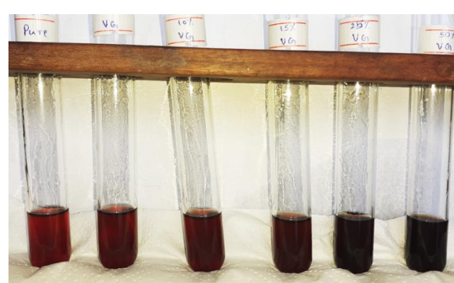
Fig. 4: Modified Salkowski's test results of pure ghee adulterated with vegetable ghee (VG)