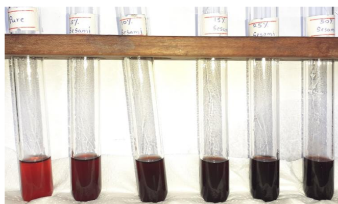
Fig. 3: Modified Salkowski's test results of pure ghee adulterated with sesame oil