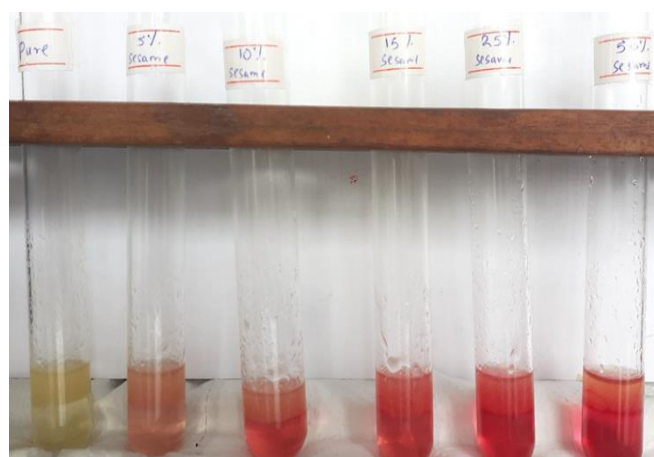
Fig. 5: Furfural test results of pure ghee sample adulterated with sesame oil