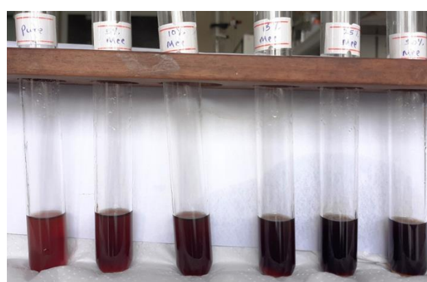
Fig. 2: Modified Salkowski's test results of pure ghee adulterated with mee oil